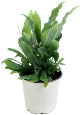
SHIPPED AS SHOWN

Note: Some leaves may appear wilted or yellow upon arrival. This is due to the stress of shipping and is nothing to worry about. Water the plant and let it recover in a shady location for a few days, then gently remove any foliage that does not recover to allow for new growth.