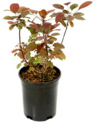
SHIPPED AS SHOWN

The foliage on potted plants may appear slightly wilted or yellow upon arrival. This is due to the stress of shipping and is usually nothing to worry about. Water the plant thoroughly, place it in a shady location for a few days and remove any foliage that does not recover.