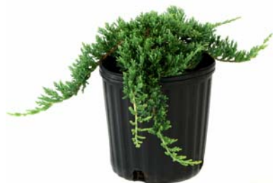
SHIPPED AS SHOWN

The foliage on potted plants may appear slightly wilted or yellow upon arrival. This is due to the stress of shipping and is usually nothing to worry about. Water the plant thoroughly, place it in a shady location and remove any foliage that does not recover.