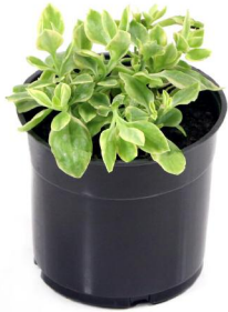
SHIPPED IN A 5.5-INCH POT. PLANT SIZE MAY VARY BASED ON GROWING CONDITIONS.

Note: Some leaves may appear wilted or yellow upon arrival. This is due to the stress of shipping and is nothing to worry about. Water the plant and let it recover in a shady location for a few days, then gently remove any foliage that does not recover to allow for new growth.