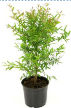
SHIPPED AS SHOWN

The foliage on potted plants may appear slightly wilted or yellow upon arrival. This is due to the stress of shipping and is usually nothing to worry about. Water the plant thoroughly, place it in a shady location for a few days and remove any foliage that does not recover.