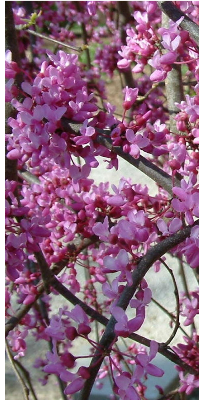
*Image on cover is representative of the type of plant(s) in this offer and not necessarily indicative of actual size or color for the included variety.