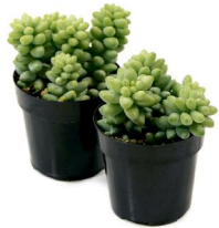
SHIPPED AS SHOWN

The foliage on potted plants may appear slightly wilted or yellow upon arrival. This is due to the stress of shipping and is usually nothing to worry about. Water the plant thoroughly, place it in a shady location for a few days and remove any foliage that does not recover.