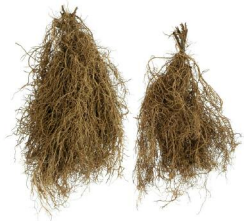
SHIPPED AS BARE ROOT DIVISIONS.

Note: Occasionally, bare root plants may arrive with a small amount of mold on them. This is caused by temperature changes encountered in shipping and does not harm the plants. As long as the bare root divisions are firm, simply wipe any mold off with a paper towel and plant them.