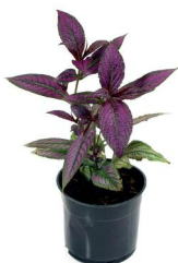
SHIPPED AS SHOWN

Note: Some leaves may appear wilted or yellow upon arrival. This is due to the stress of shipping and is nothing to worry about. Water the plant and let it recover in a shady location for a few days, then gently remove any foliage that does not recover to allow for new growth.